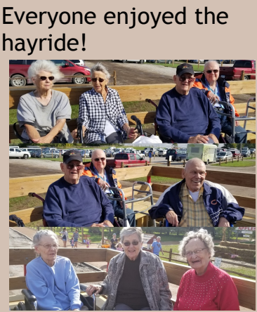
Everyone enjoyed the hayride!