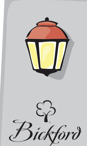
assisted living & memory care