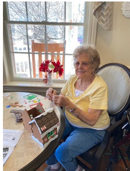
Gingerbread and Happy Hour!! Lots of Fun