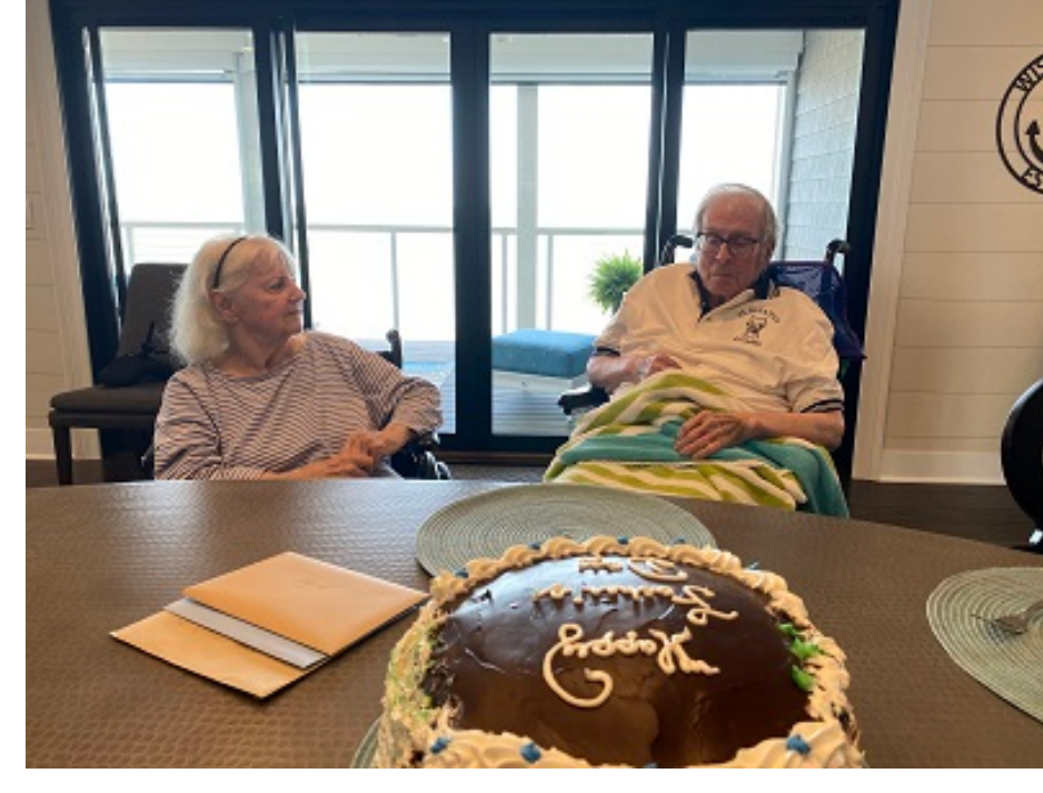
Mickey got a friend Minnie!!