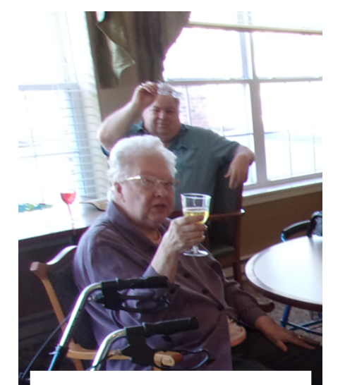
We lifted our glasses. Some of us took this to a new level.