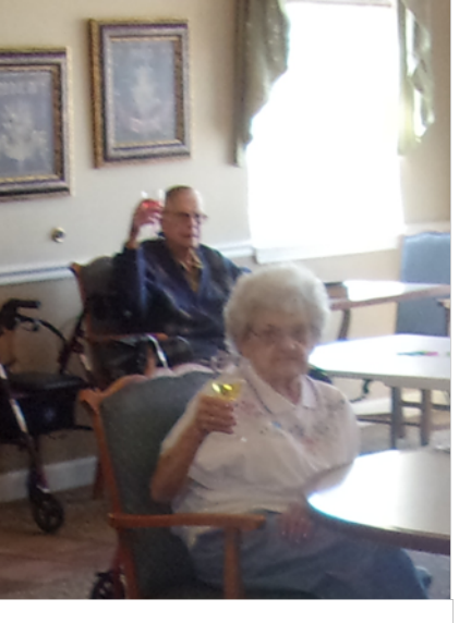
We celebrated whatever we felt like celebrating.