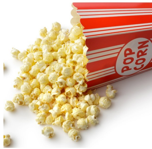
Enjoy the Fun Friday popcorn bar!