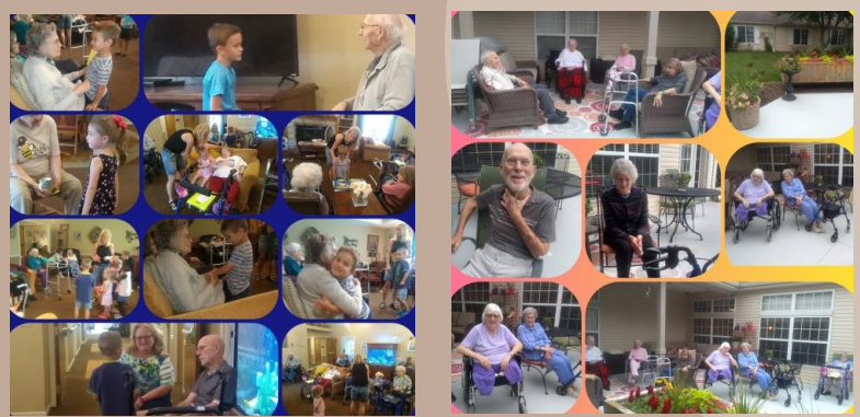
Happy Days Daycare