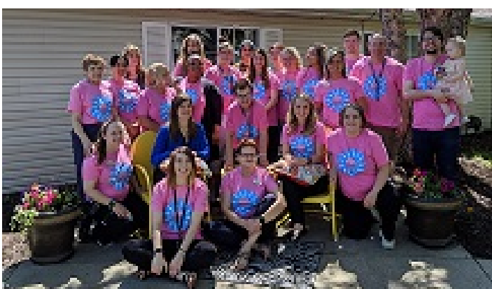
Some of our amazing staff sporting pink t-shirts that say, "Our resident's bring us joy". And they certainly do!!!