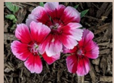
Derby day and gardening. May was busy busy. Along with our Tuesday painting group, we had a lot of fun!