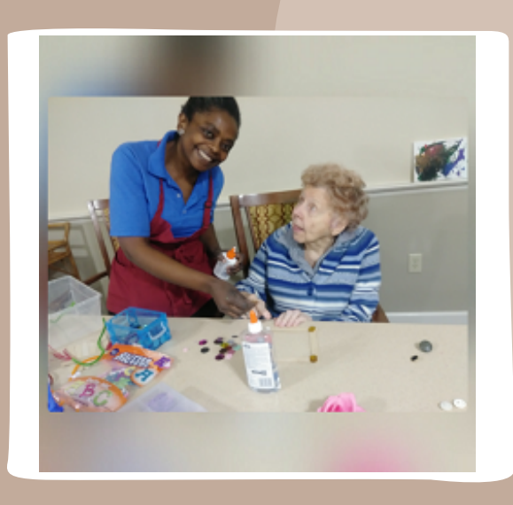
Sometimes all we need is just a smiling face.