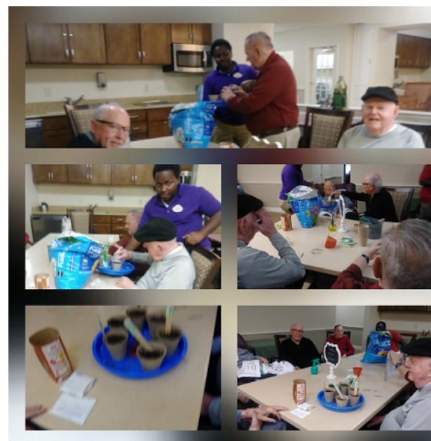
The Men's Club doing a bit of indoor planting.