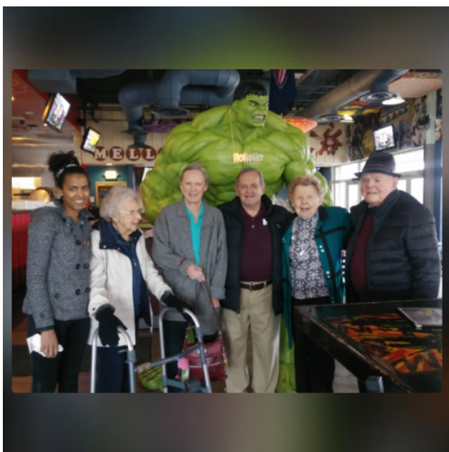
Some of our residents thought it would be really funny to take a picture with "The Hulk" after eating at Mellow Mushrooms!