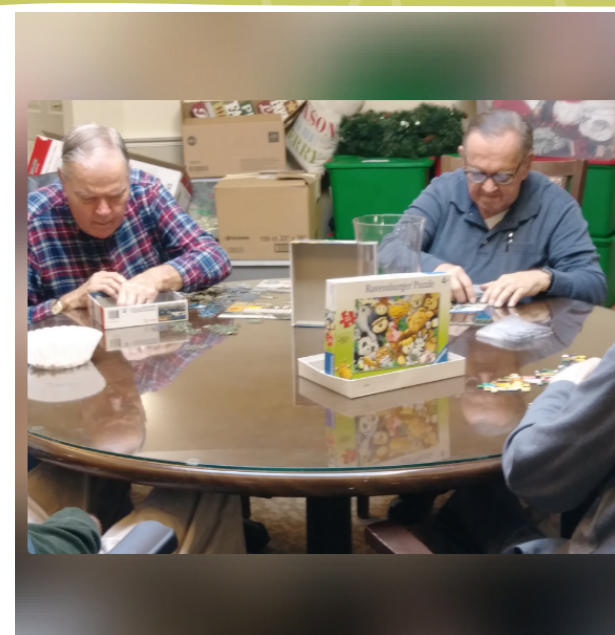
Puzzles are fun but always better when done together!