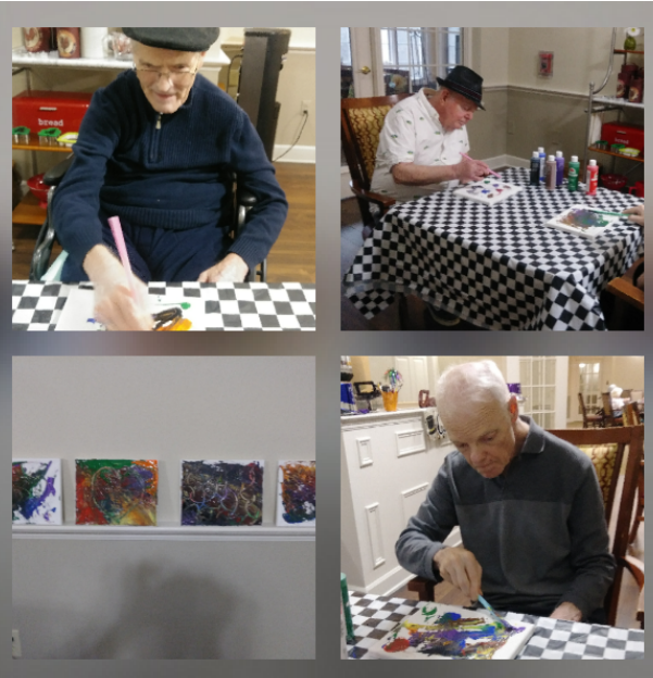
Our Gentlemen on Mary B's busy with an art program.