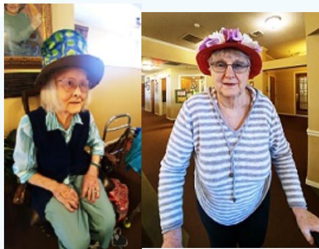
Started the month off with Hat Day!!!