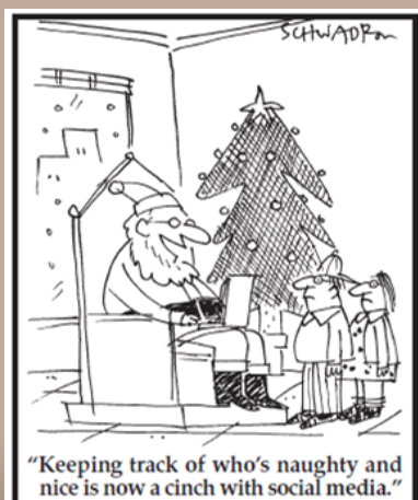
from JoyfulNoiseletter.com

"And so, as Tiny Tim observed, God bless Us, Every One!"