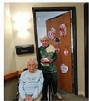
"Valentines Day Door Wars"