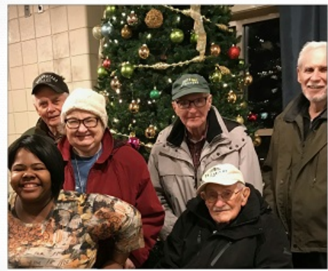
POTTER'S PARK CHRISTMAS LIGHT TOUR