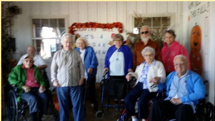
Country Mill & Color Island Boat Trip