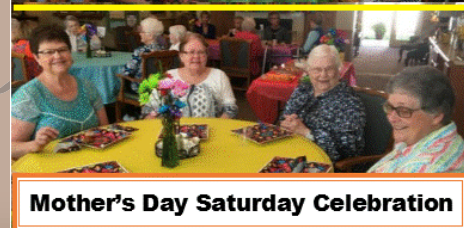
Mother's Day Saturday Celebration