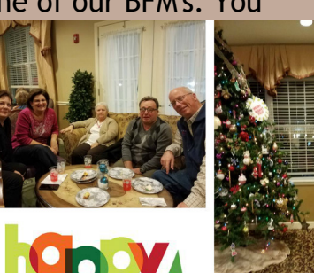
figure out who the weekly mystery person is. If by Friday no one can guess who our mystery person is I will give 2 additional clues. Who ever can figure out who our mystery person is will get a prize. Our first set of clues will be out January 2nd Good Luck.

Guess Who, do you know will have 1 week to who I am? We'll see if you can guess who I am. I'm giving you 10 clues and or quotes about me, and see if you can guess who I am. Every Monday afternoon we will put out 10 new clues for our Guess Who Mystery game on our bulletin boards. Our mystery person can be someone famous or one of our BFM's. You