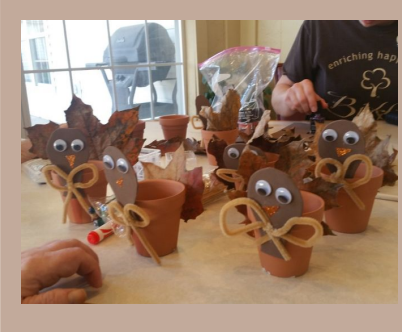
Turkeys we made out of flower pots and real leaves from outside.