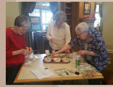
together omelets for National Egg Day.