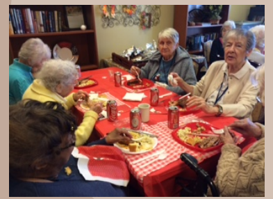
A few sticky fingers but plenty of napkins and tons of fun!